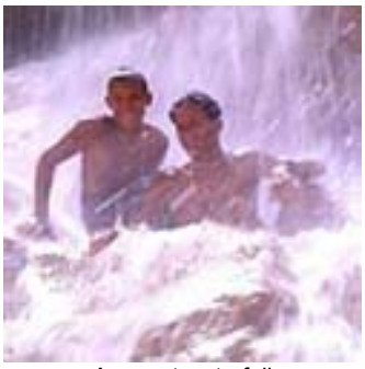
A secret waterfall