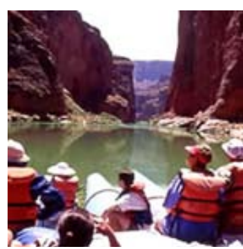
A lazy float