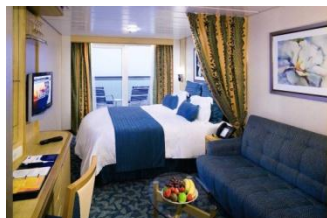
OUTSIDE STATEROOM BALCONY